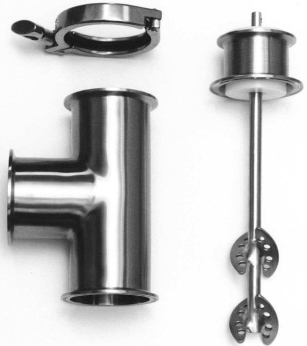
Model Shown 107B-M Blender

*** Drive needed for blenders, see Blender Drives for selection.