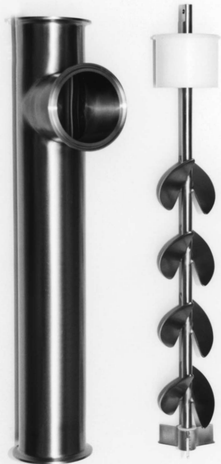
Model Shown 107B-HD Blender

*** Drive needed for blenders, see Blender Drives for selection.