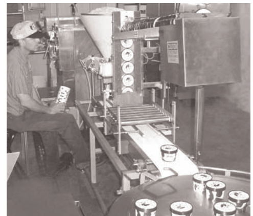
Sawvel Model #133DP-TT with Automatic Lidding

Above: In plant at Wright Dairy, shown with optional hopper blanket.