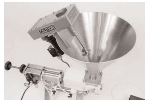
Optional Hopper Mixer