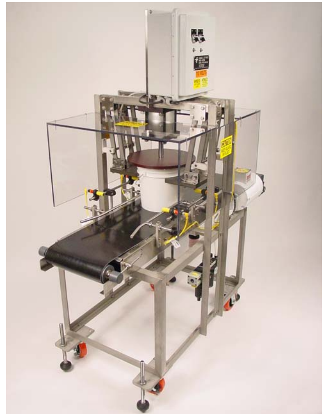
Shown with Optional Container Support Assembly and Jack Screws with Leveling Pads