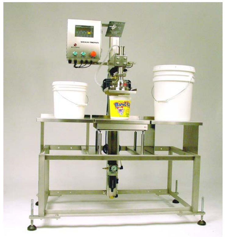
Shown with Optional Stainless Steel Frame, Ball Valve Mount Post and Drip Guard