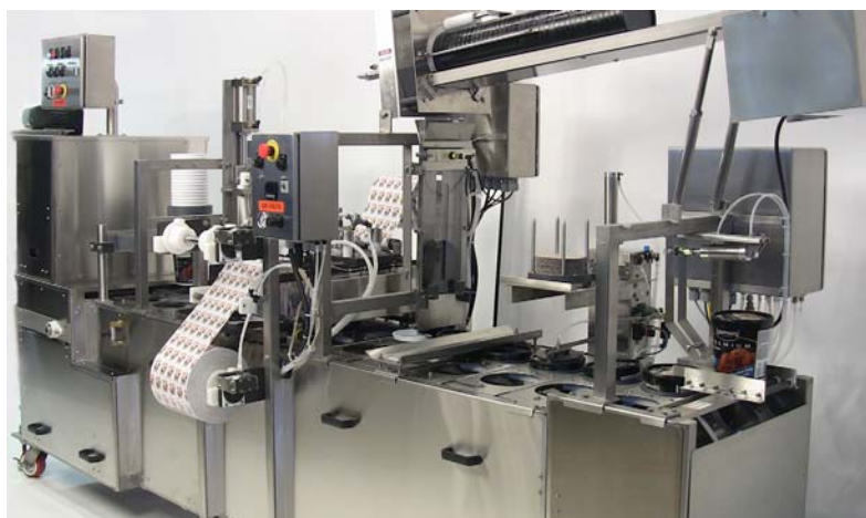
Shown with Custom Single Lane Tooling