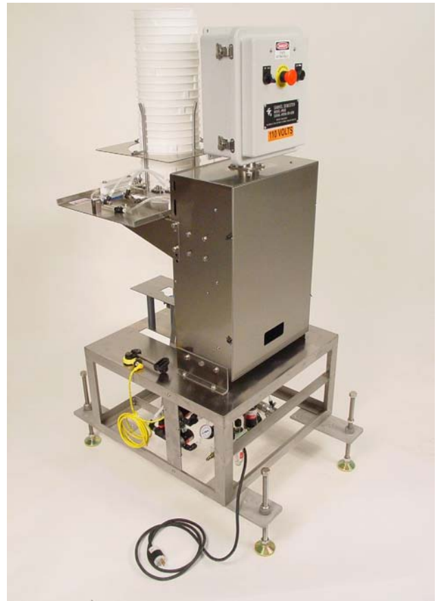
Floor Model Shown