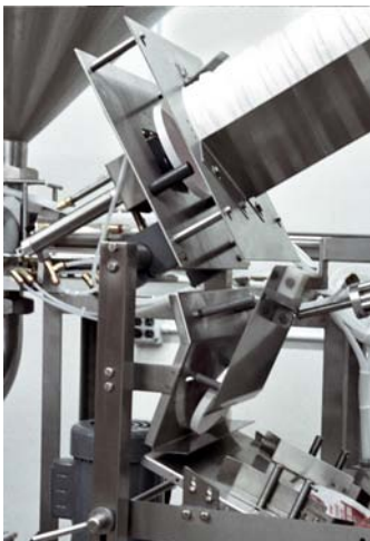
Reverse Lid Feature