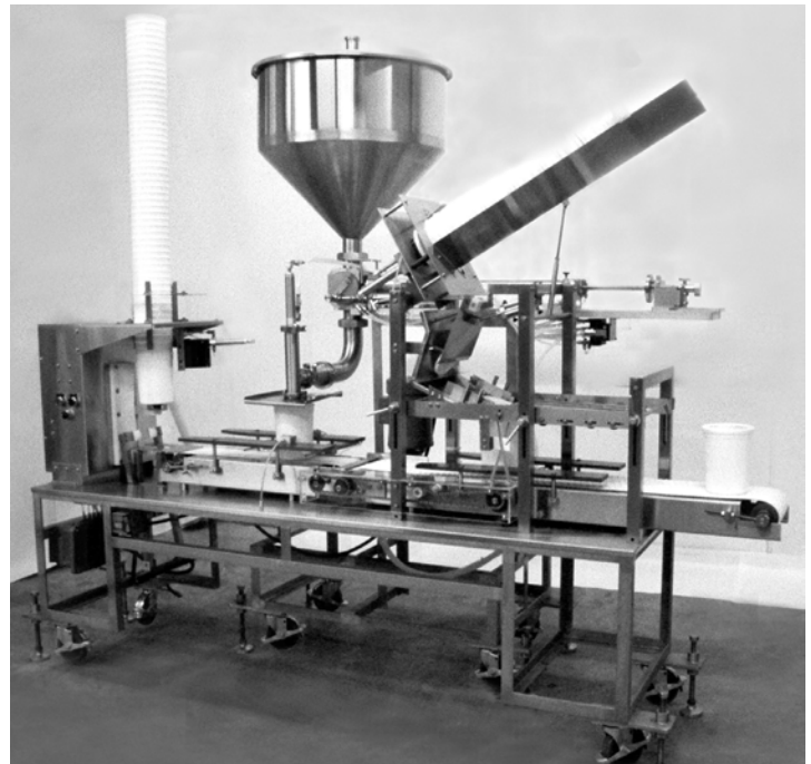
Shown with Model 70DP Piston Depositor